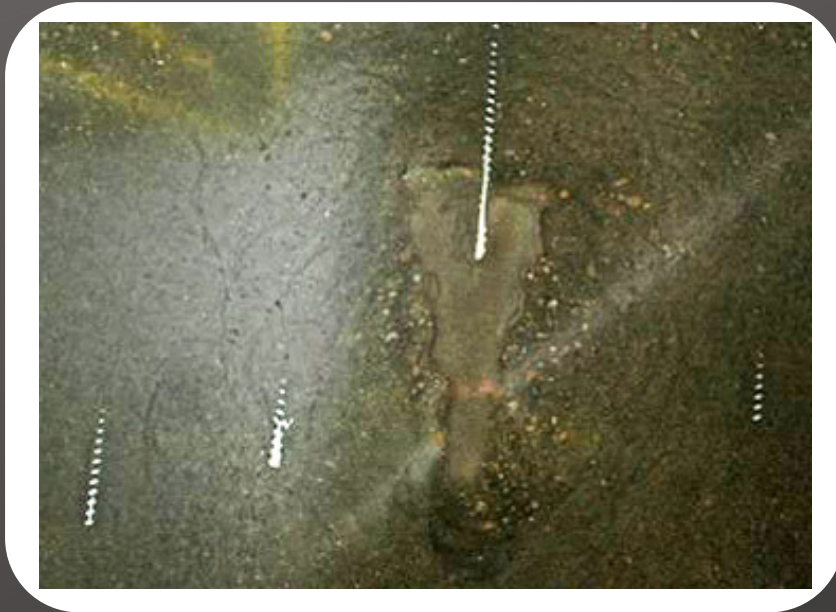
Exposed rebar from improper placement