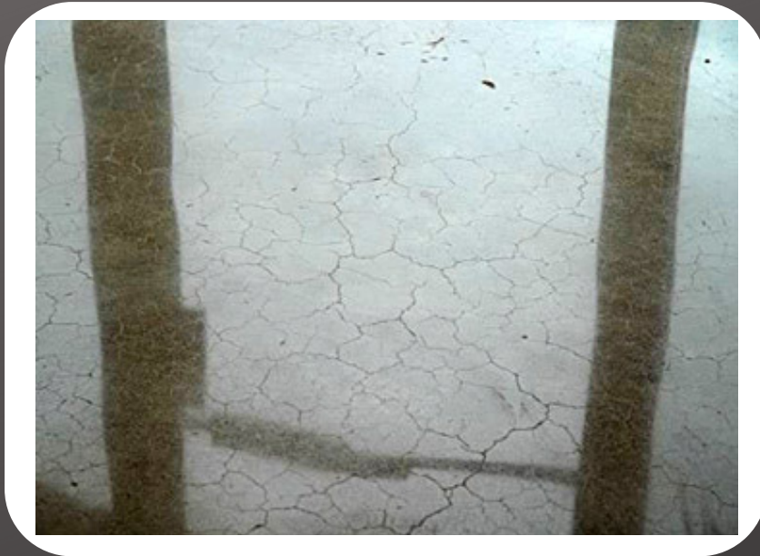
Surface crazing created by improper curing or a mix that dried too fast