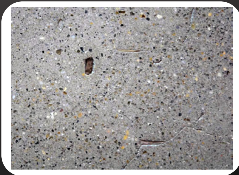
Debris imbedded in the concrete (ex. wood chunks, foam, etc.)